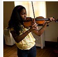
A Family Ritual in Haiti Is Threatened