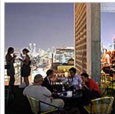
10 New Hot Spots if Summer Needs Sizzle