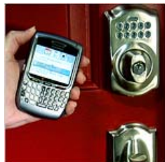
Installing Your Own Home Security System