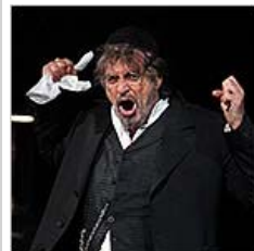
Railing at a Money-Mad World